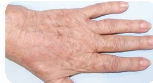
After Laser360i on the hands