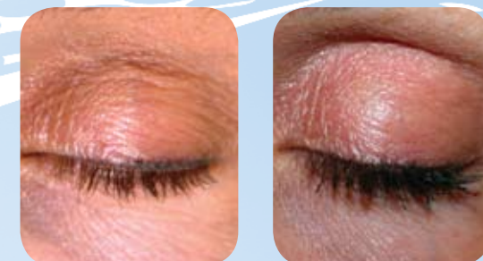
Before After Pixel