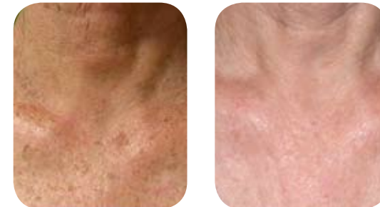
Before After Laser360i on the chest