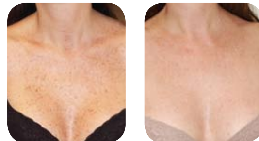
Before After AFT 570 SR