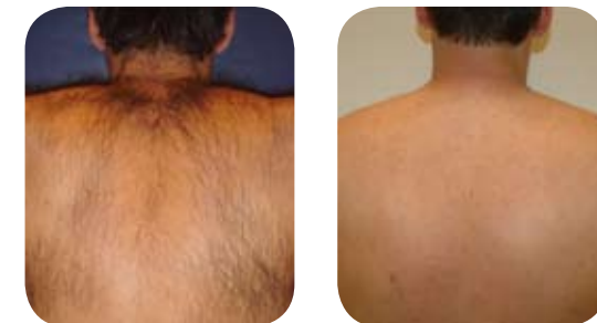
Before After SHR