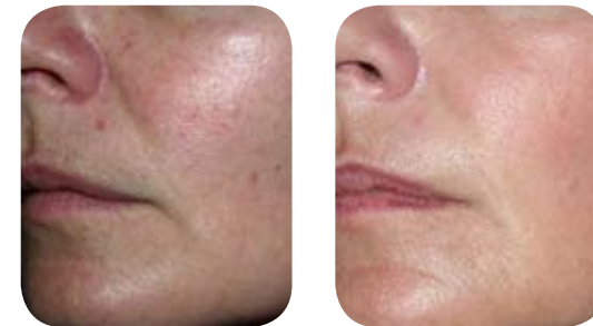
Before After Mini Laser360i

iPixel ER for fractionated skin resurfacing