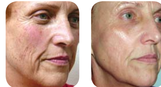
Before After Laser360i on the face