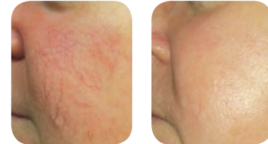
Before After AFT 540 VP