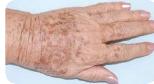
Before After Laser360i on the hands