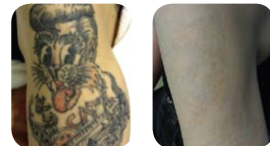
Before After QS Nd:YAG 1064